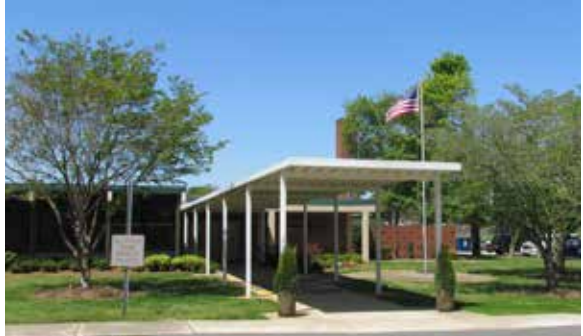
Brookstone Schools, located off West Boulevard in the Amay James Pre-K-K Center, celebrates 12 years of educating inner-city children.

Let your light so shine before men, that they may see your good works and glorify your Father in heaven.